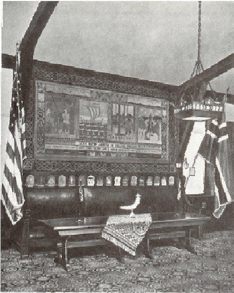
The head table was the "high seat" for Torske Klub and other functions. The mural is now cared for by the Vesterheim Museum.

No it isn't a misspelling. Many of us remember the days when the Chicago Torske Klub, met at the facilities of the Chicago Norske Klub on Kedzie Blvd. in Chicago. As we approach our 50th year of existence, we have only a few artifacts of those early days, and over the years, we have fewer members that remember the magnificent building and hall that we met in for those first dinners.