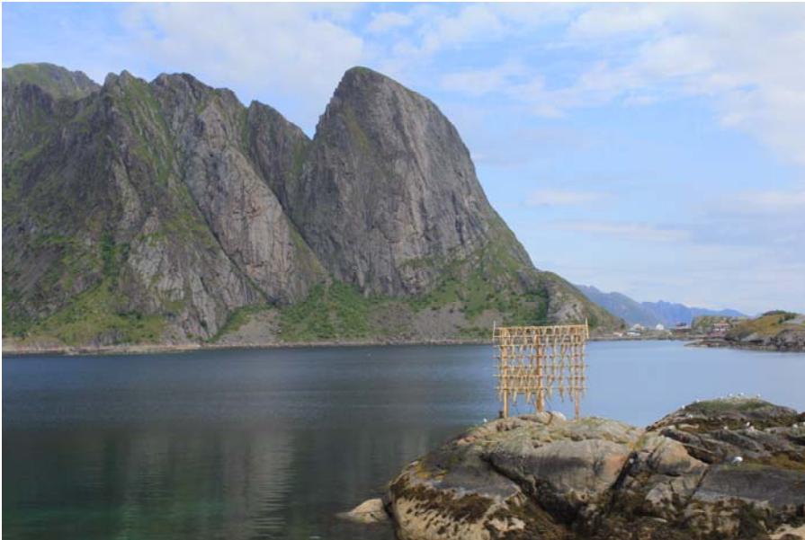
Lofoten Islands near Henningsvær

Happy birthday to all of our good members, and skål.