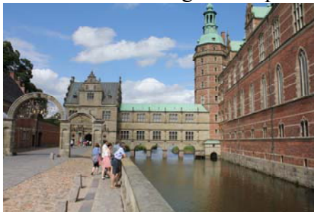
Fredericksborg Castle in Denmark