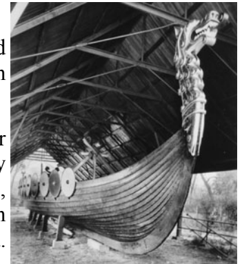
The Viking Ship sat in an open shed in Lincoln Park for many years

Join us for this first luncheon of the year.